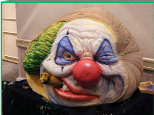
Wow! Who knew that a clown was hiding in that pumpkin!