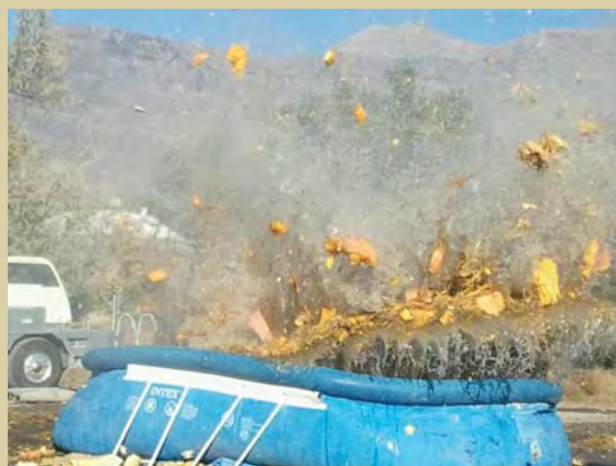
Pumpkin explodes in pool