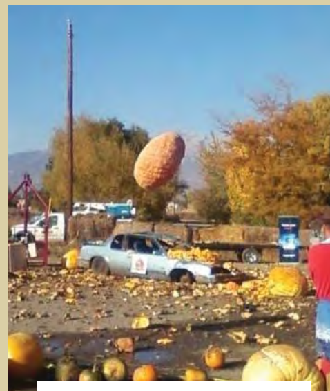
Ross Bowman's pumpkin being dropped on car