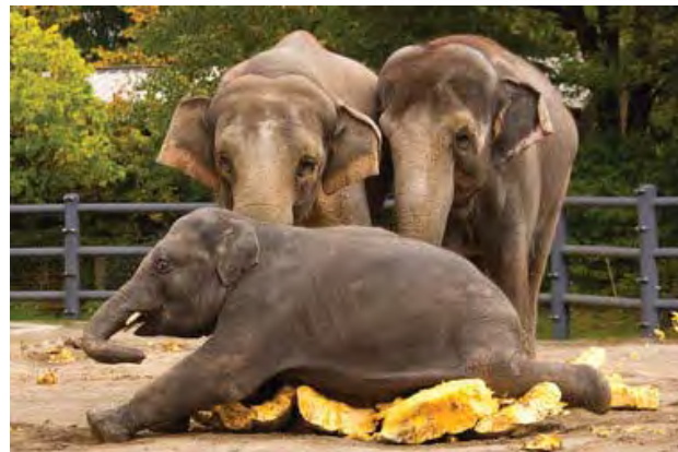
Hogle Zoo Thursday, November 27th