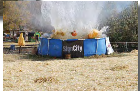
The Drop Saturday, October 25th