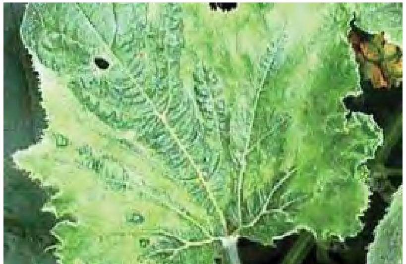
Mosaic Virus on pumpkin leaf