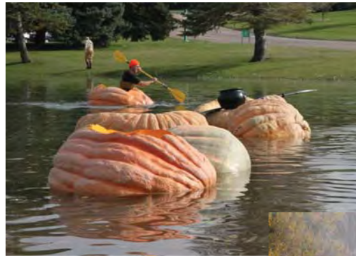
Regatta Saturday, October 18th