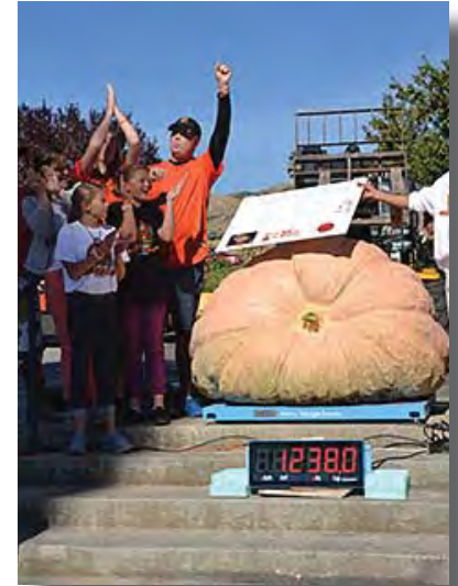
Weigh-off Saturday, September 27th