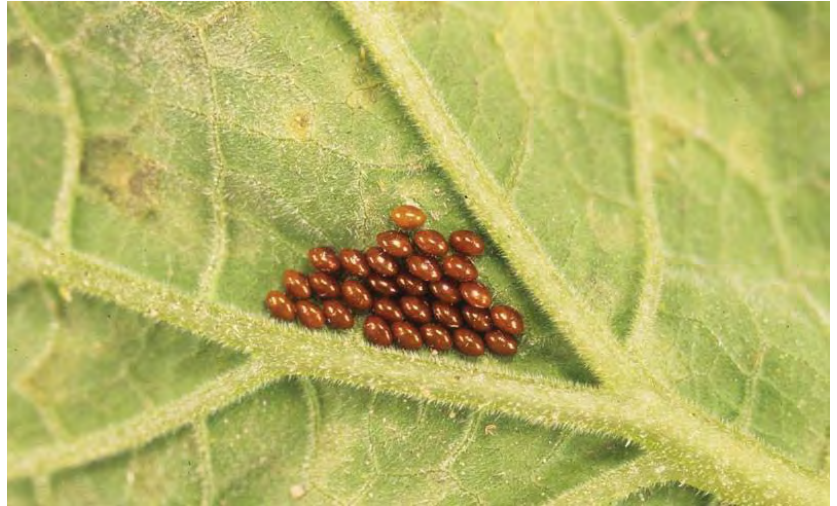
Squash Bug eggs on underside of pumpkin leaf

in your patch, one thing remains the same--preventing disasters before they happen is the key. When your pumpkin stops growing due to disease or insects, unfortunately it will not simply start to grow again once the treatment has been administered.