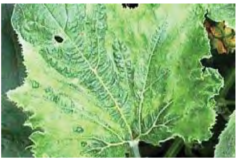
Mosaic Virus on pumpkin leaf