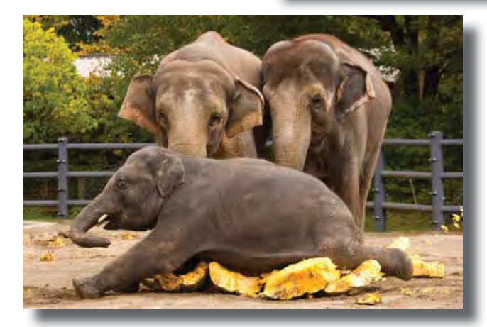
The Drop Saturday, October 25th