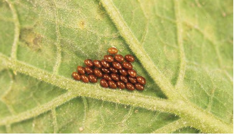
Squash Bug eggs on underside of pumpkin leaf

It is important to note that there are many organic solutions to disease pressure and insects as well. For growers who are committed to maintaining organic growing practices, good results can still be achieved. Whether you choose to grow organically, or implement a chemical program