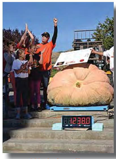
Weigh-off Saturday, September 27th