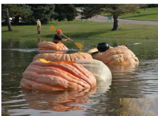
Regatta Saturday, October 18th